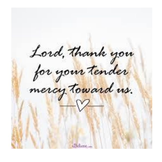
Stay with us, Lord...on our journey.