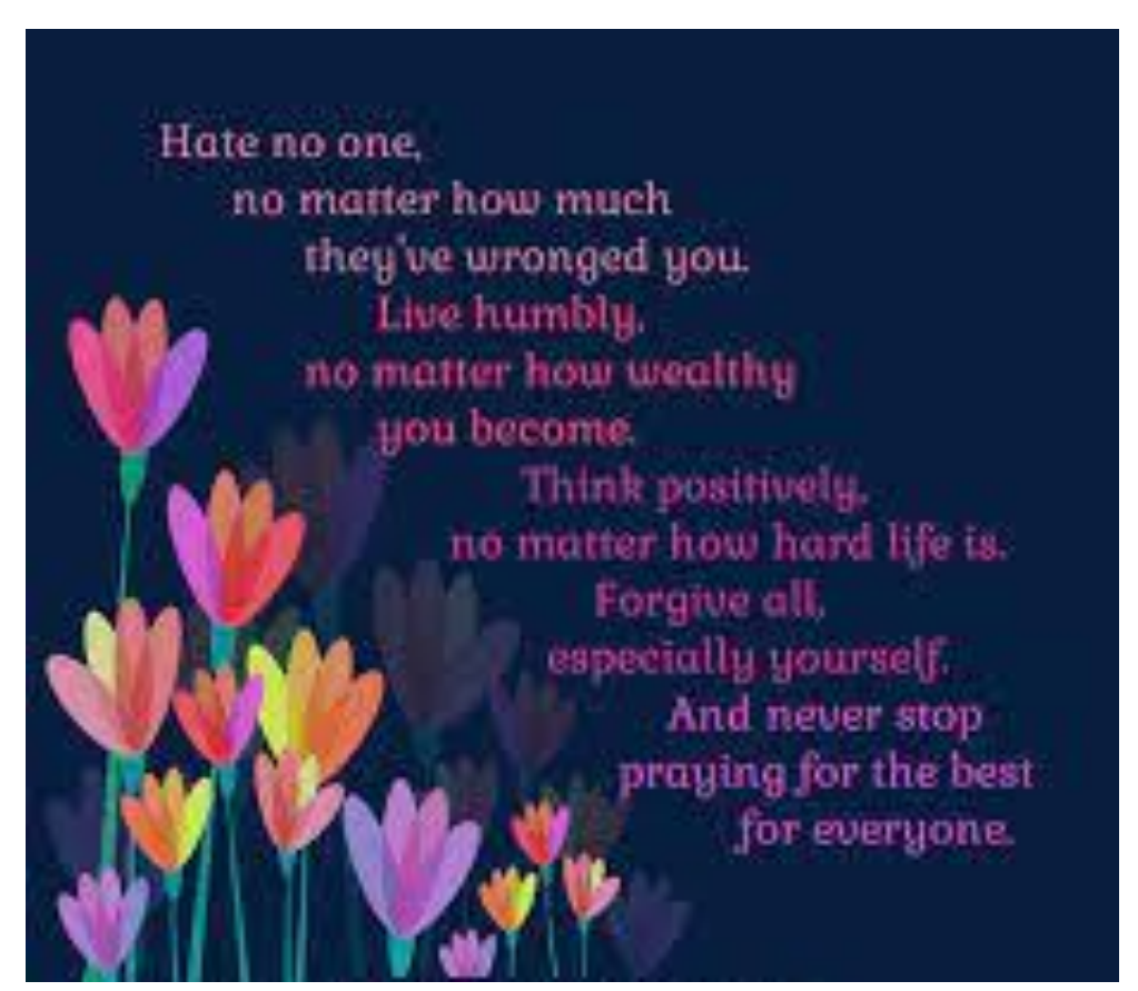
Stay with us, Lord...on our journey.